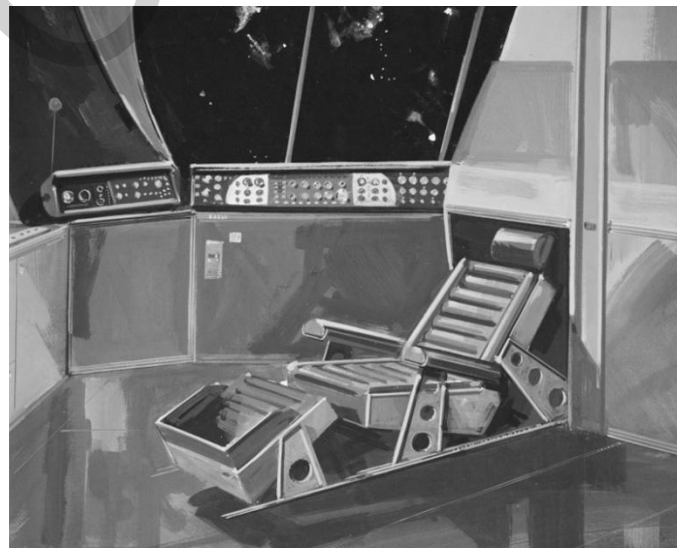
When the set designer sketched the concept for the “womb couch,” by which Smith would make his entrance into the episode, no one knew about Jonathan Harris's acute claustrophobia.

Harris was not comfortable getting into the enclosed compartment containing the hidden acceleration couch. The script identified it as a “womb couch.” Harris insisted that a stand-in do the “stunt.” He later related, “There was one scene where I had to be in a coffin-like structure under a counter, and then be pulled out. Well, I'm terribly claustrophobic, and I just wouldn't do that. I would have walked before I did that. And the director said, ‘You have to be in the coffin.’ Well, there's time for that later on, right? So, of course he called Irwin on the