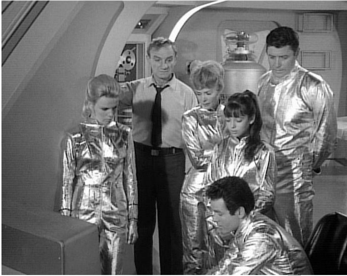
Day 2: Cast and crew move to the upper deck of the Jupiter 2.

The camera stopped rolling at 7:15 p.m. The production was on schedule. That would soon change.